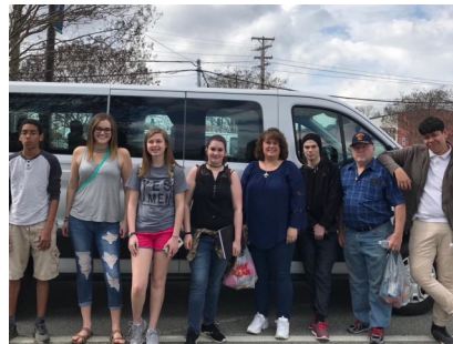
WinterJam was enjoyed by all!