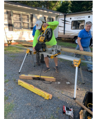
IMPACT:Ramseur was able to build a ramp for the Tate family this month. Thanks to everyone who made this ramp possible!